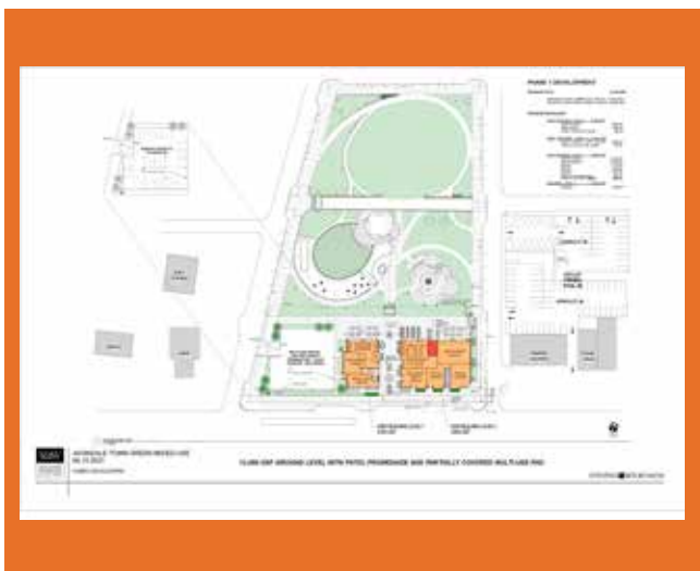
City of Avondale Estates Town Green Plan