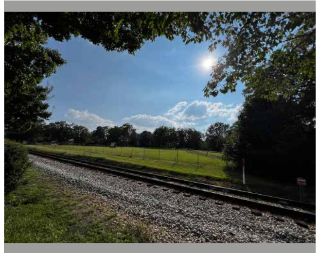
City of Stone Mountain