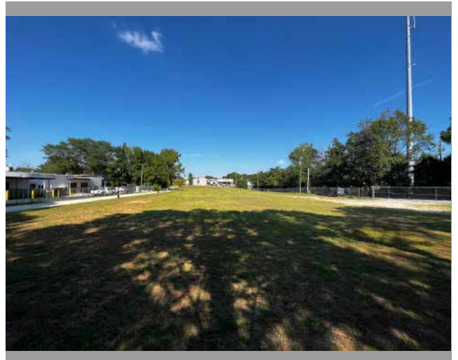
City of Tucker