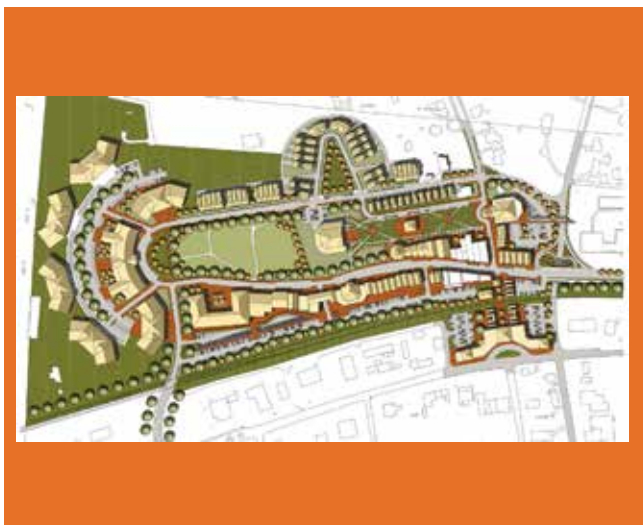
City of Duluth Town Green Plan: Seizmore Group