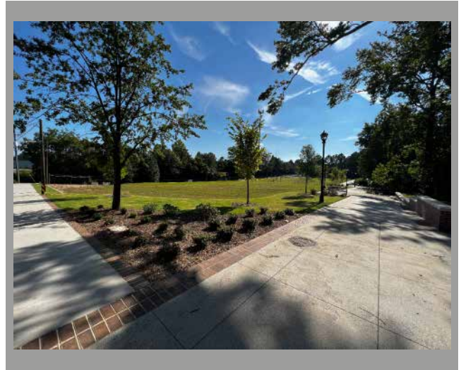
City of Tucker