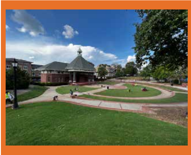
City of Duluth