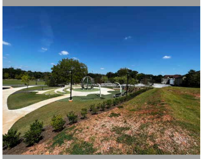
City of Avondale Estates

All town greens studied were centrally located to their respective Downtown areas, offered similar key amenities, had development plans or updates, and were surrounded by a mix of residential, office, retail, and restaurant uses. The development cost for these projects tended to be around or above $5 million.