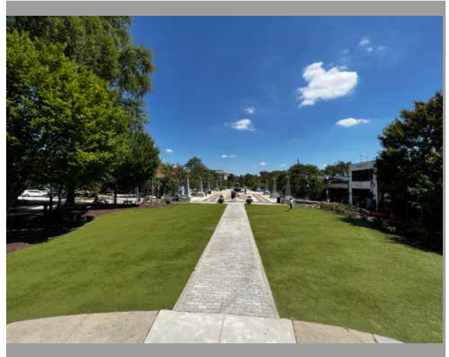
City of Decatur