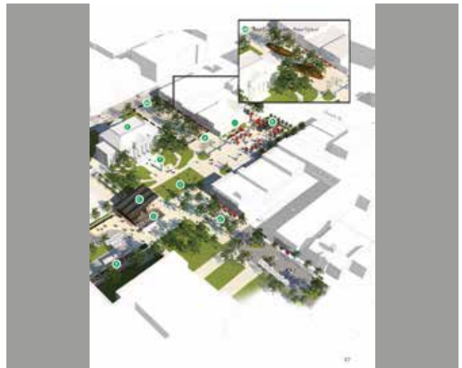
City of Decatur Town Green Master Plan