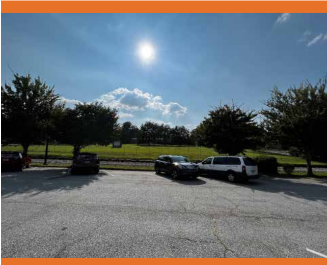
City of Stone Mountain