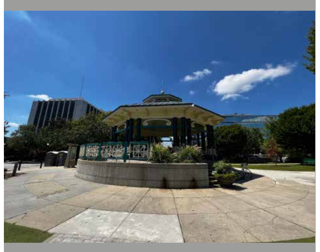
City of Decatur