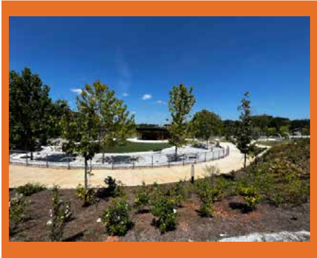
City of Avondale Estates